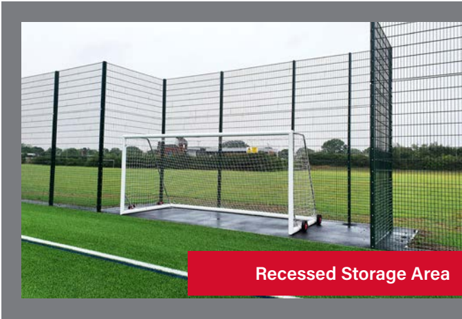
Recessed Storage Area