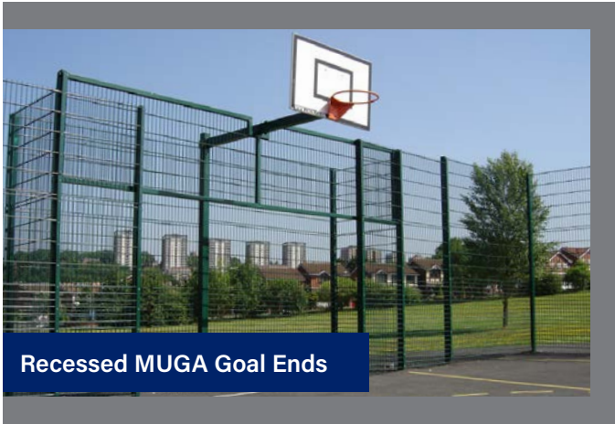
Recessed MUGA Goal Ends